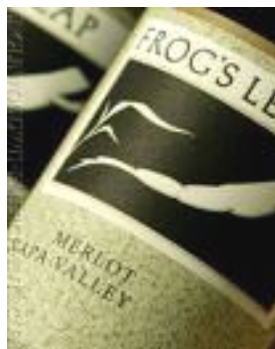
Frog's Leap Merlot Napa Valley, California 78